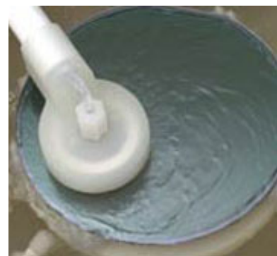
Figure 2: Arm 3, megasonic clean