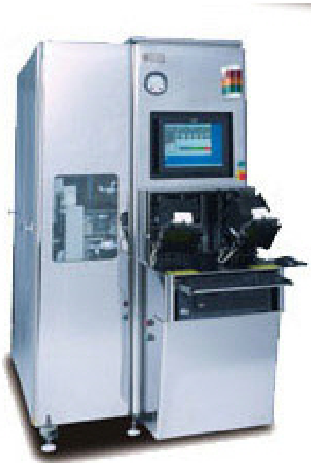
Figure 1: The SSEC Trilennium Cleaning Tool

The SSEC Trilennium cleaning tool is a highly flexible apparatus. This flexibility is gained due to the capability of handling various substrate sizes together with 7(!) different cleaning options, which can be utilized in each required sequence. With respect to the substrate sizes this means 100mm, 150mm and 200mm round substrates as well as 4", 5", 6" and 7" square substrates. However by fabricating a new substrate holder it is also possible to handle any rectangular substrate that consists of a combination of the mentioned square sizes.