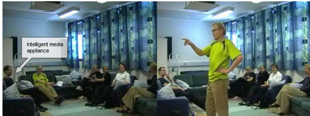
Figure 5: Potential users acting at the sofa (using an intelligent media appliance) and research team member acting a scene

did take up the intended roles during this discussion, so only the physical aspects of acting were lacking.