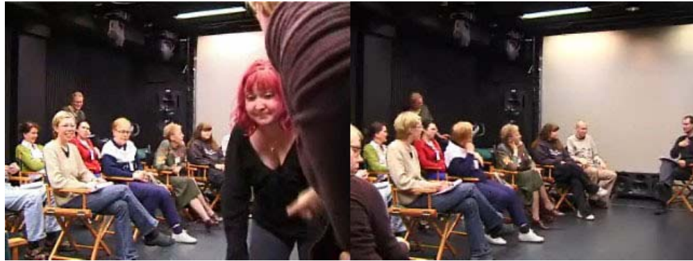
Figure 4: Robotic appliances and discussion after scene

The last technique was quite similar to the machine to machine technique used in the first session (figure 4). We asked the audience to name a few household appliances or areas of a home. In addition to this we asked for events to occur during the acting. The actors incorporated these events into their improvised scene. In order to better guide the scene, we this time interrupted the acting regularly with a "pause"-command, upon which the actors stopped acting while we discussed the situation and gave more directions from the audience.