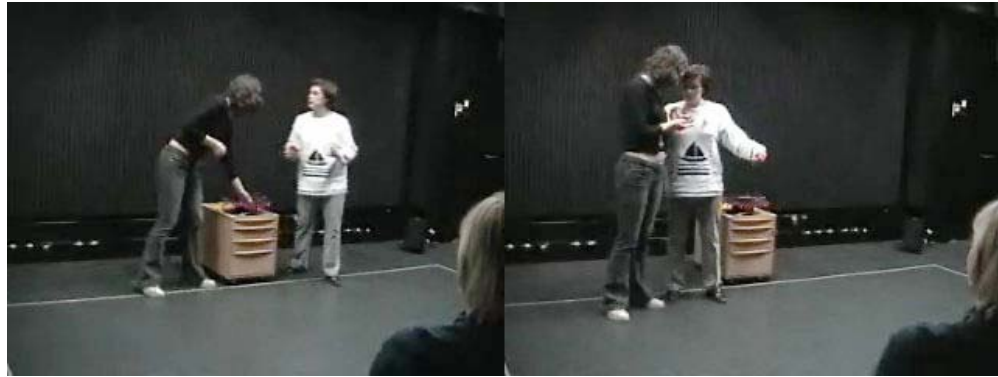
Figure 3: "Piece of paper" act in the first session

In the machine to machine communication of the second technique we asked the audience to provide the roles of the actors (e.g., vacuum cleaner, kitchen, living room, refrigerator, porch). Again active communication between the actors and the audience was encouraged.