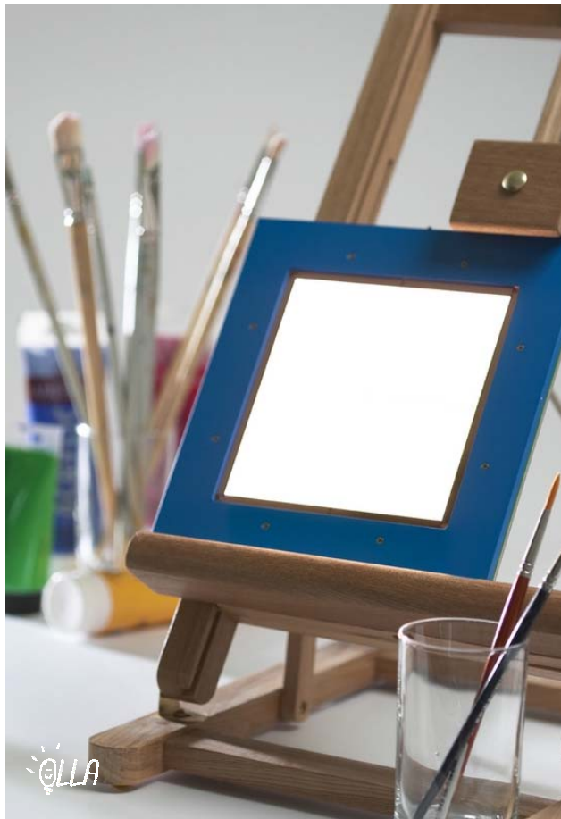
Caption: Organic LEDs can be made in various colors (including warm and cold whites) with very high color rendering index