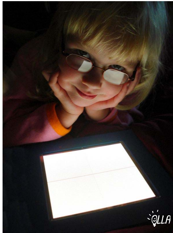
Caption: OLED is a revolutionary novel efficient lighting technology. The thin glass plate lighting tiles are based on organic materials and do not make use of mercury. Therefore OLEDs are (potentially) fully recyclable.

Novel released pictures in conjunction to this text: