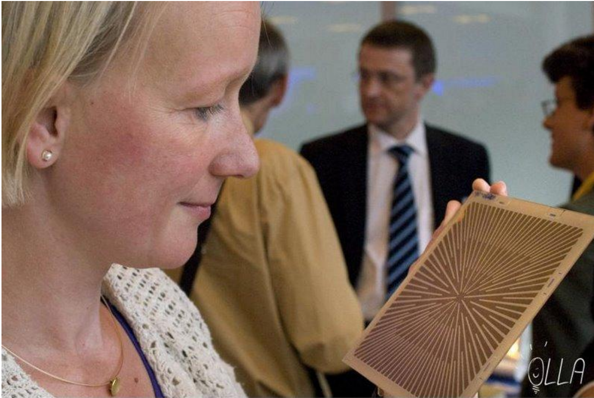
Caption: The OLLA project showed it's results last Thursday on a public event in Eindhoven, the Netherlands.

Note: High-resolution version images can be downloaded from: www.olla-project.org Pictures may only be used in conjunction with this press release.