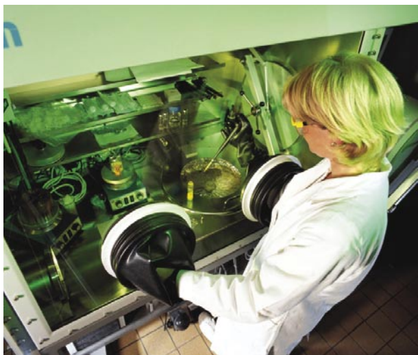
Merck OLED Materials GmbH

Feedback from material and device tests is essential for the development and synthesis of new OLED materials