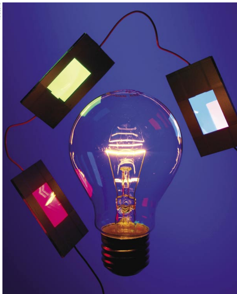
OLEDs can be made in every color, including warm and cold white. These flat and energy efficient devices are soon to replace our well-known light bulbs