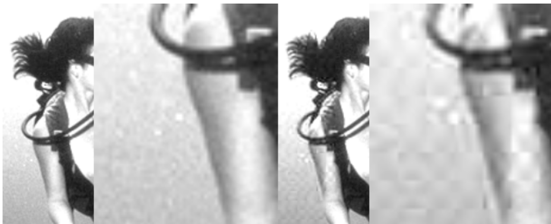
Figure 1a. Unlabeled image and zoom view Figure 1b. Labeled image using Zhao's method

A weak point of the method of Zhao is that the quality of the picture is heavily reduced by a label, which is resistant to JPEG compression up to a quality of 50%. This is illustrated in Figure 1. In the left half of the picture (1a) the unlabeled image and a corresponding zoom view of the shoulder is given. In the right half (1b) the labeled image (quality 50%) and the corresponding zoom view of the shoulder is represented.